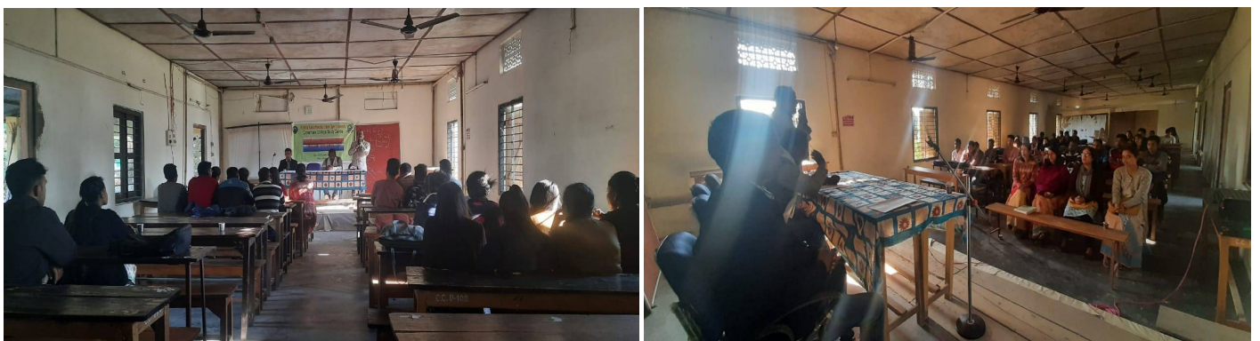
Induction Programme for newly admitted learners organized by Cinnamara College Study Centre, Jorhat on 20 th Dec, 2020