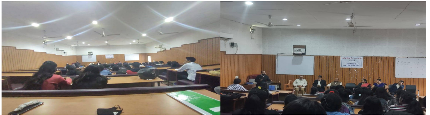
Induction Programme for newly admitted learners organized by J. B. College Study Centre, Jorhat on 13 th Dec, 2020.