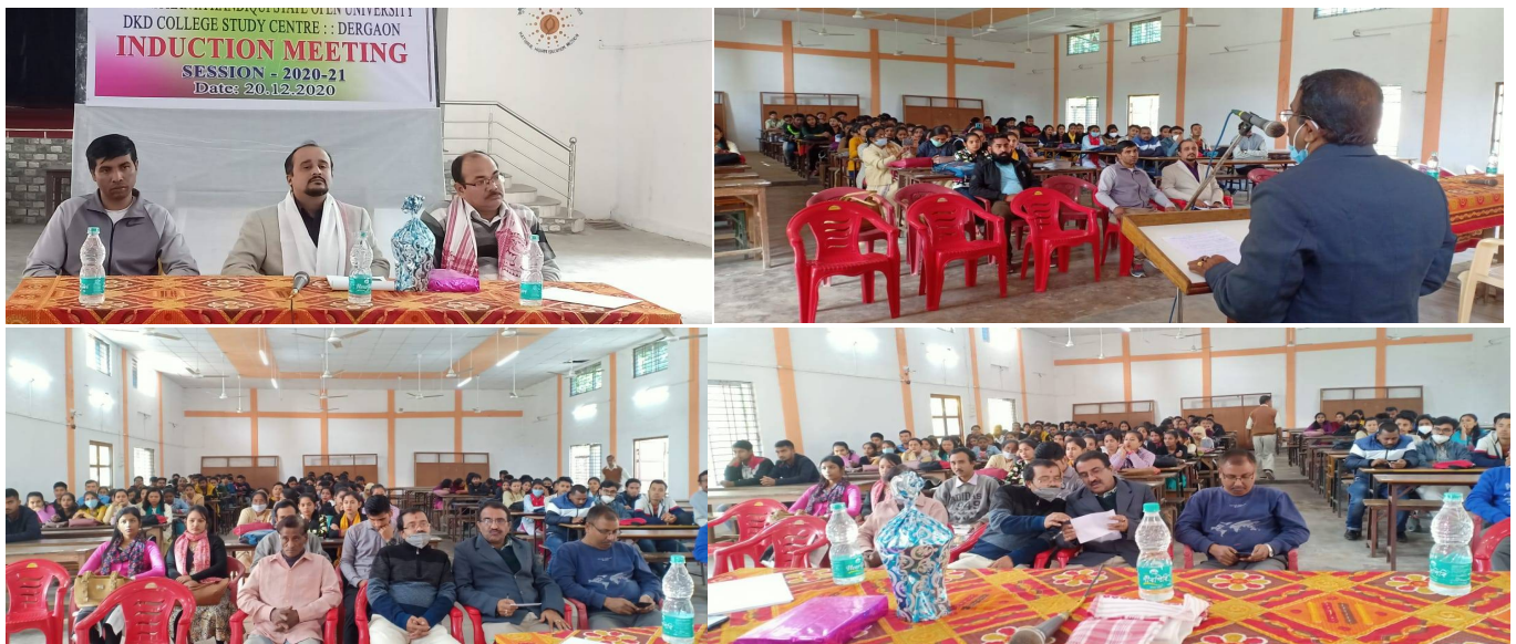
Induction Programme for newly admitted learners organized by DKD College Study Centre, Dergaon on 20 th Dec, 2020.